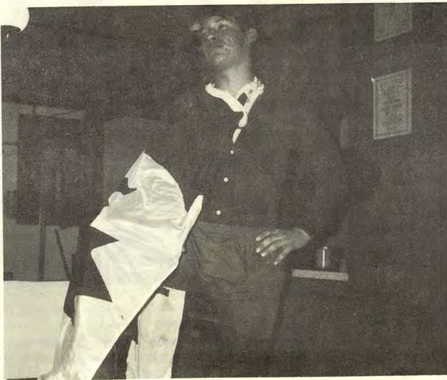
Captain Canada: faster than a speeding building able to leap over the tallest bullet!